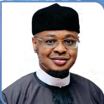
Dr. Isa Ali Ibrahim (Pantami) FNCS, FBCS, FIIM.

Minister for Communication and Digital Economy, Federal Republic of Nigeria.