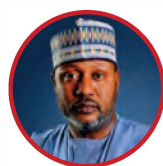
Barr. Mohammed H. Abdullahi Minister of (State) Science and Technology, Nigeria.

Pantami is a fellow of both British Computer Society (FBCS) and Nigeria Computer Society (FNCS). He also has many fellowships to his credit.