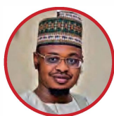
Dr. Ali Ibrahim Isa Pantami Minister of Communication and Digital Economy, Nigeria.

Isa Ali Ibrahim also known as Sheikh Pantami is the Minister of Communications and Digital Economy in Nigeria. He was the Director General and CEO of the National Information Technology Development Agency (NITDA) of Nigeria, when he was nominated as minister and sworn into office on the 21st of August, 2019. Pantami lectured at Abubakar Tafawa Balewa University in Information Technology before joining the Islamic University of Madinah as Head of Technical Writing in 2014. He is also trained on Digital transformation in Harvard University, USA, then Management Strategy in both, Massachusetts Institute of Technology, and Institute of Management Development in Loussaune, Switzerland. He was also in Cambridge University for Management Programme, among others.